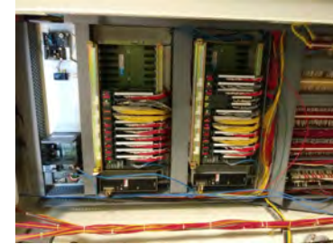
Lieb CSO, PLC Panel