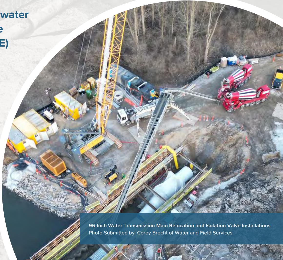
96-Inch Water Transmission Main Relocation and Isolation Valve Installations