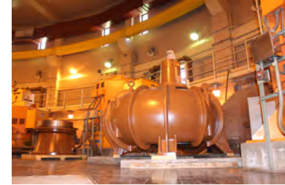
Main Raw Sewage Pumps at Pump Station 2