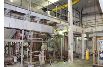
Primary Circular Scum House, Inside