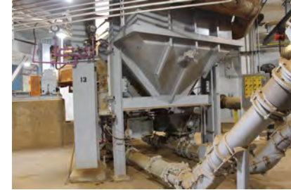
Incineration Complex II, Ash System