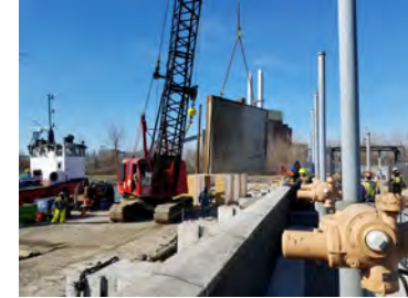
Effluent Relief Gate Repair