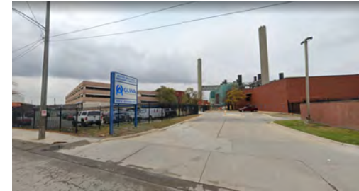
WRRF Front Entrance