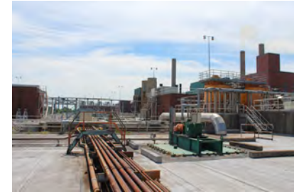
Aeration Basin 1 and ILP's 1 and 2