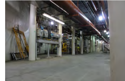
Complex B, Basement