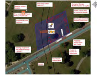
Example of Proposed Facility