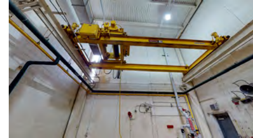
Coroded building crane from failed HVAC system