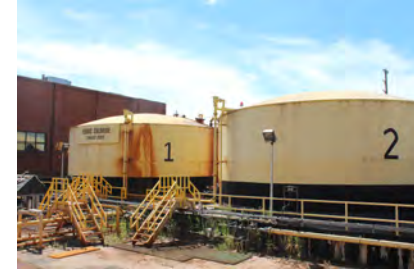
Ferric Chloride Storage and Containment Area