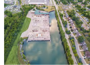
Conner Creek CSO Facility