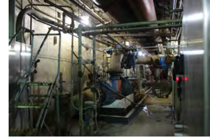
Sludge Feed pump in Complex A