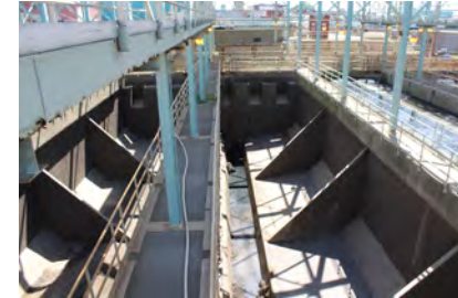
Pump Station 2, Grit channels