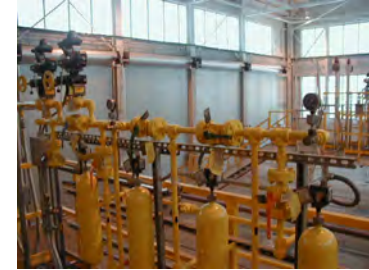
Chlorination Building, Inside