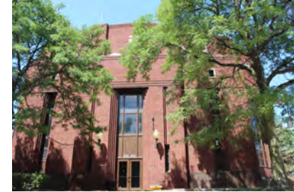
Pump Station 1