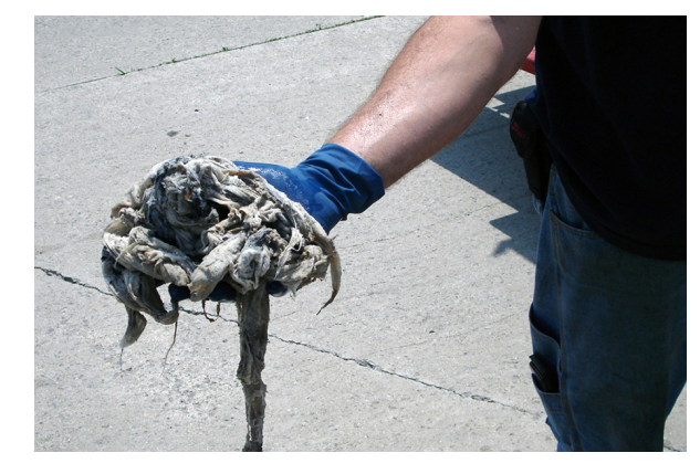
Nonwoven wipes clog sewers and equipment in pump stations and wastewater treatment plants because they don't break apart in water. The extra maintenance required to remove them comes at a cost to all sewer system users.